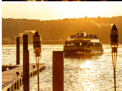
Arrive by boat & make your event more special